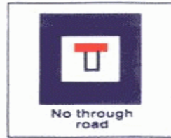
No through road