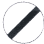
Restriction ends sign