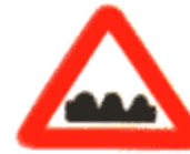
Hump or rough road