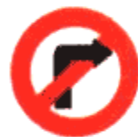
Right turn prohibited