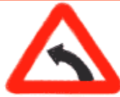
Left hand curve