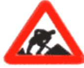
Men at Work