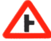
Side Road Right