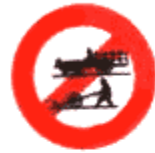
Bullock carts and hand carts direction