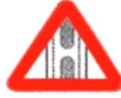
Gap in Median