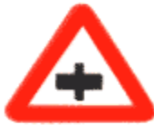
Major road ahead