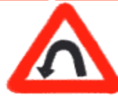
Left hair pin bend