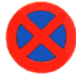
No stopping or standing