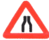
Narrow road ahead