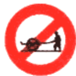
Hand carts direction