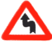
Left reverse bend