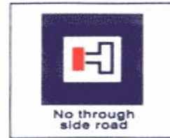
No through side road