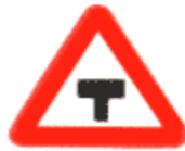
Major road ahead