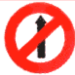
Straight Prohibited or no entry

MANDATORY SIGNS- Red circle instructs what should not be done.