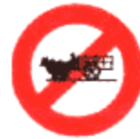
Bullock carts direction