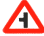
Side Road Left