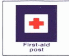
First aid post

INFORMATION SIGNS - Signs in the Blue rectangle informs.