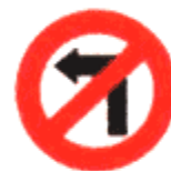
Left turn prohibited