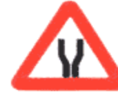
Road wideness ahead