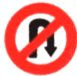
U- turn prohibited