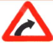
Right hand curve

CAUTIONARY SIGNS - Signs in the Triangle is for cautions.