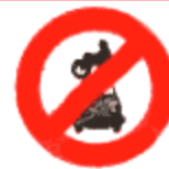
All vehicles prohibited