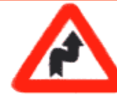
Right reverse bend