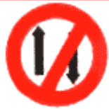
Vehicles prohibited in both direction