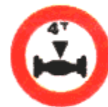
Axle load limit